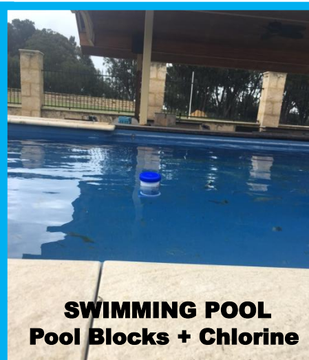
SWIMMING POOL Pool Blocks + Chlorine